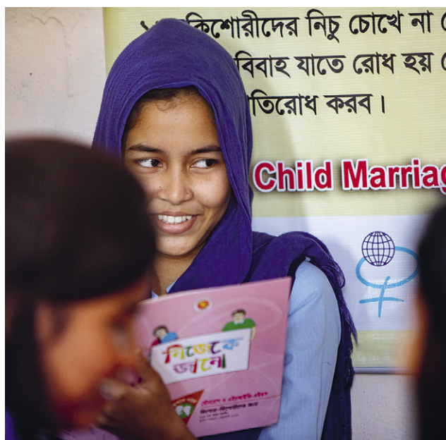
Empowered against child marriage: In 2023, 3600 adolescents participated in relevant awareness-raising sessions in Bangladesh.

All these factors heighten the vulnerability of girls and women. Despite these challenges, thanks to the tremendous efforts of our partner organizations and budget and project adjustments, we were able to continue all projects in 2023 and further advance our efforts to strengthen the health and rights of girls and women – with encouraging results: The number of births in the health centres supported by us increased to almost 5700 (previous year: 3383). 90 aspiring midwives were able to complete their training thanks to our scholarships (previous year: 72), and 225 midwives received further training (previous year: 34). Additionally, we expanded our efforts against gender-based violence to the Somali region in Ethiopia and saw initial improvements there. For us, it is clear that we are doing our utmost to support the girls and women in our partner countries. Our vision remains a world where all people can live healthy and self-determined lives.